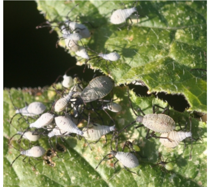
Squash bug .