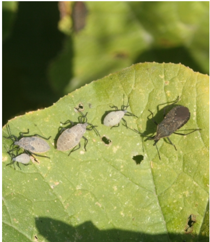
Adult with mixed life stages of squash bugs.

Adult squash bugs and their eggs are very resistant to insecticides, so spraying should be timed to kill the nymphs soon after they come out. The sprays must come into contact with the bugs themselves to be effective. Try to cover the entire plant with spray, including the stems and the undersides of the leaves where the bugs usually hide. Obviously, even "organic" sprays come with risks and problems, so try the other tips here first, and you may be able to skip the sprays altogether.