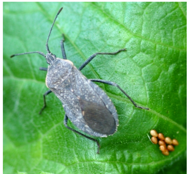
Adult squash bug with cluster of eggs.