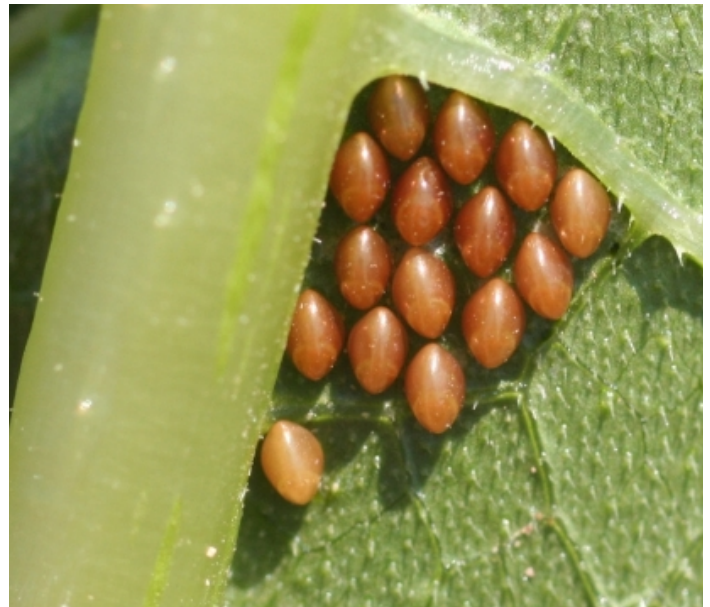
Close-up of eggs.

When female flowers appear on your plants you will need to uncover them for pollination by flying insects. Covering works very well when used together with succession planting (see #3). When it is time to remove the covers on your first round of squash, have another round ready to plant under cover. Then, when your first planting gets old or beaten down by squash bugs, destroy the plants and they squash bugs by sealing them into big plastic trash bags and leaving them in the sun to bake for a few days. Uncover your next planting, but only after the first planting is destroyed, otherwise the squash bugs can come right over and find your new plants!